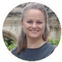
Caitlin Scott Friendship Bridge