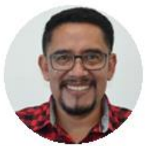
Víctor Contreras Friendship Bridge